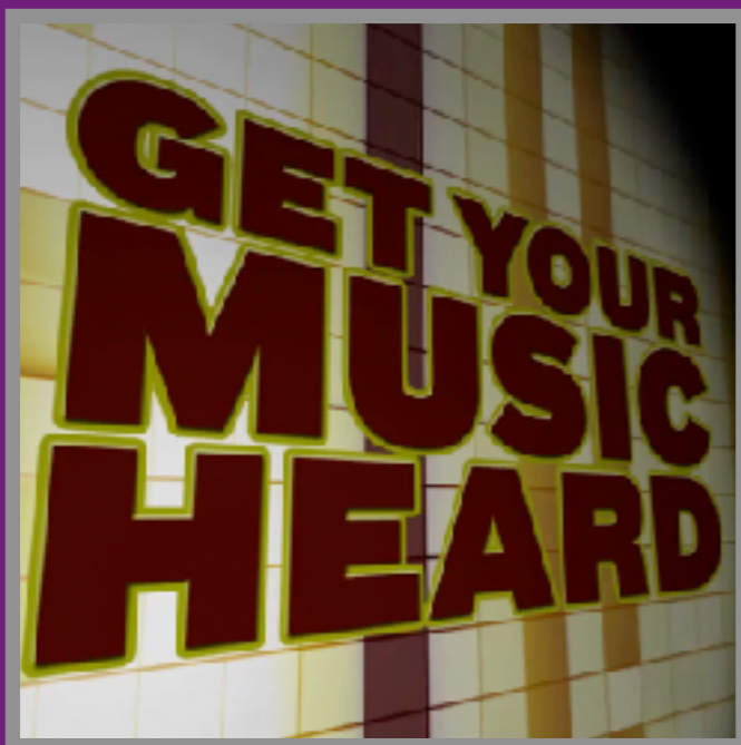
Get Your Music Heard Promo Video