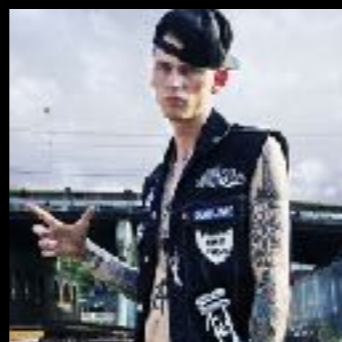
Machine Gun Kelly