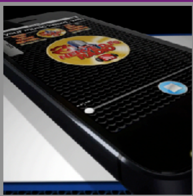
NerveDJs Radio App