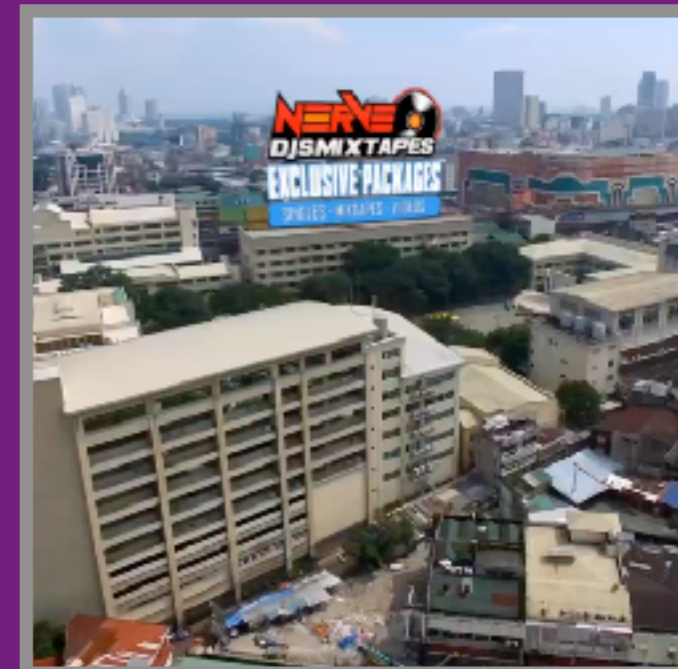
NerveDJs 2017 Promo Video