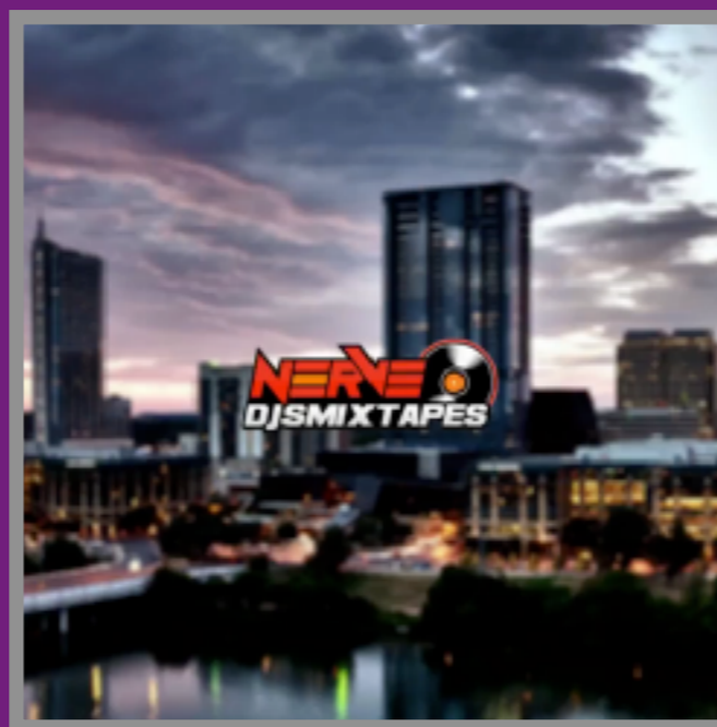
NerveDJs 7th SXSW Stage